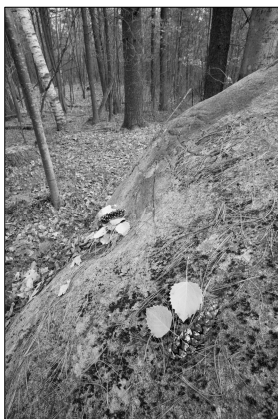
Dunstable's rural and agricultural character.

The story of Ferrari Farm begins over a year ago when The Dunstable Rural Land Trust (DRLT), the Town of Dunstable, and The Trust for Public Land (TPL), embarked on an ambitious partnership to conserve the 159-acre landscape. The project’s main objectives included; protecting important wildlife habitat and natural resources; creating an expanse of 425 acres of protected land; enabling continued public access to the property for expanded recreational opportunities; and preserving the historic Read-Parkhurst house and surrounding landscape, helping ensure